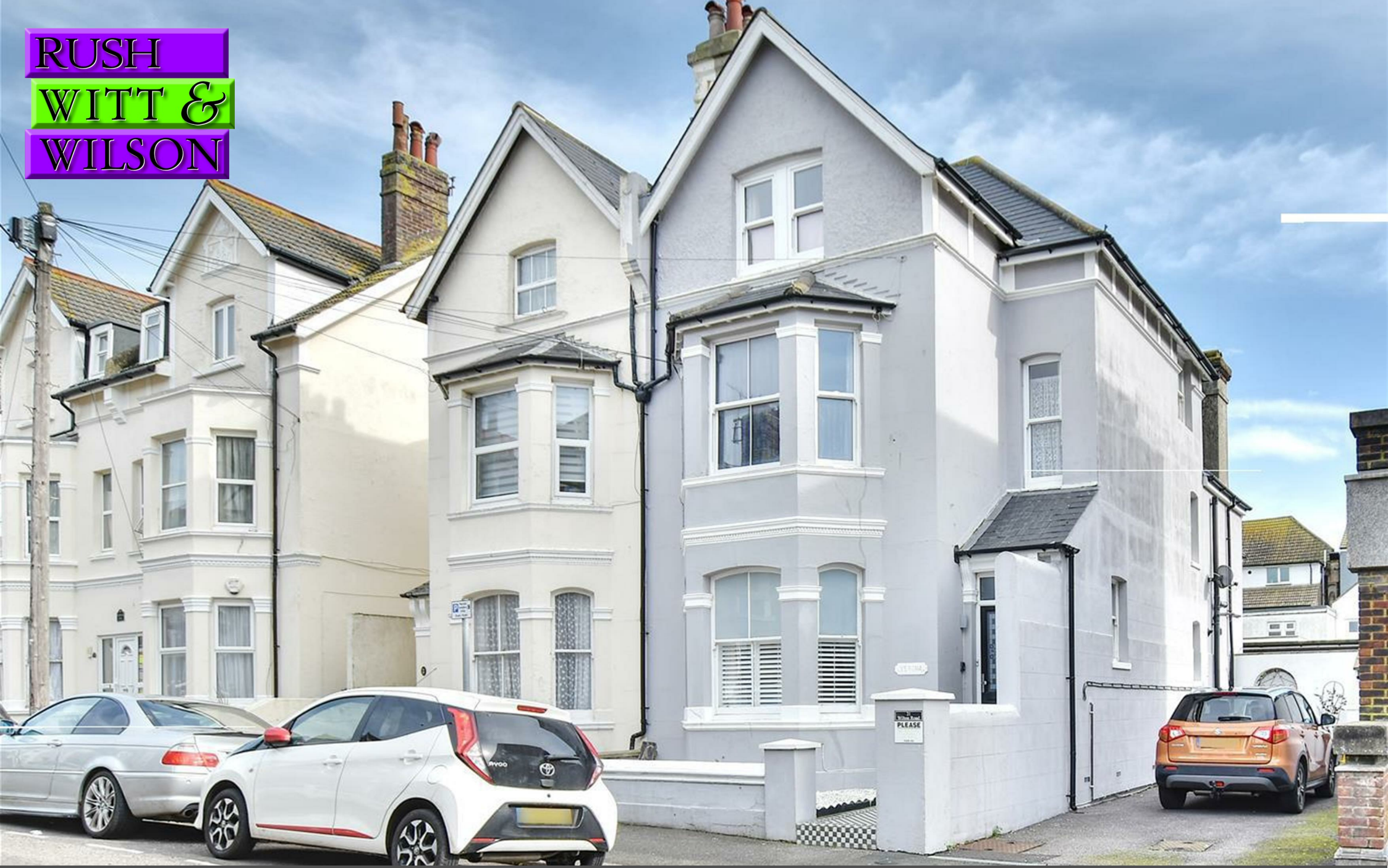
21 Wilton Road, Bexhill-On-Sea, East Sussex TN40 1HY £479,000